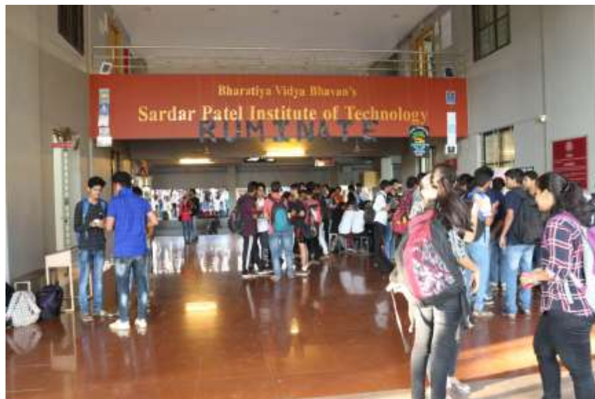
RUMINATE (12 AND 13 OCTOBER 2017)